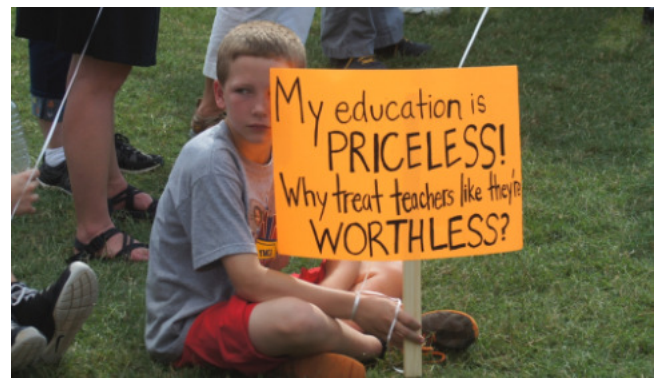
photographs of Moral Mondays